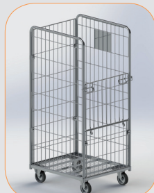
FIXED LOWER PANEL + NESTABLE DOOR OPTION 2