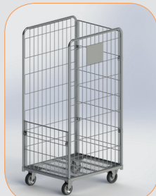
FIXED LOWER HALF PANEL OPTION 1