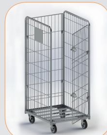
GRAND STABLE DOOR OPTION 4