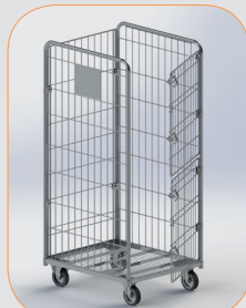
2 X HALF STABLE DOORS OPTION 3